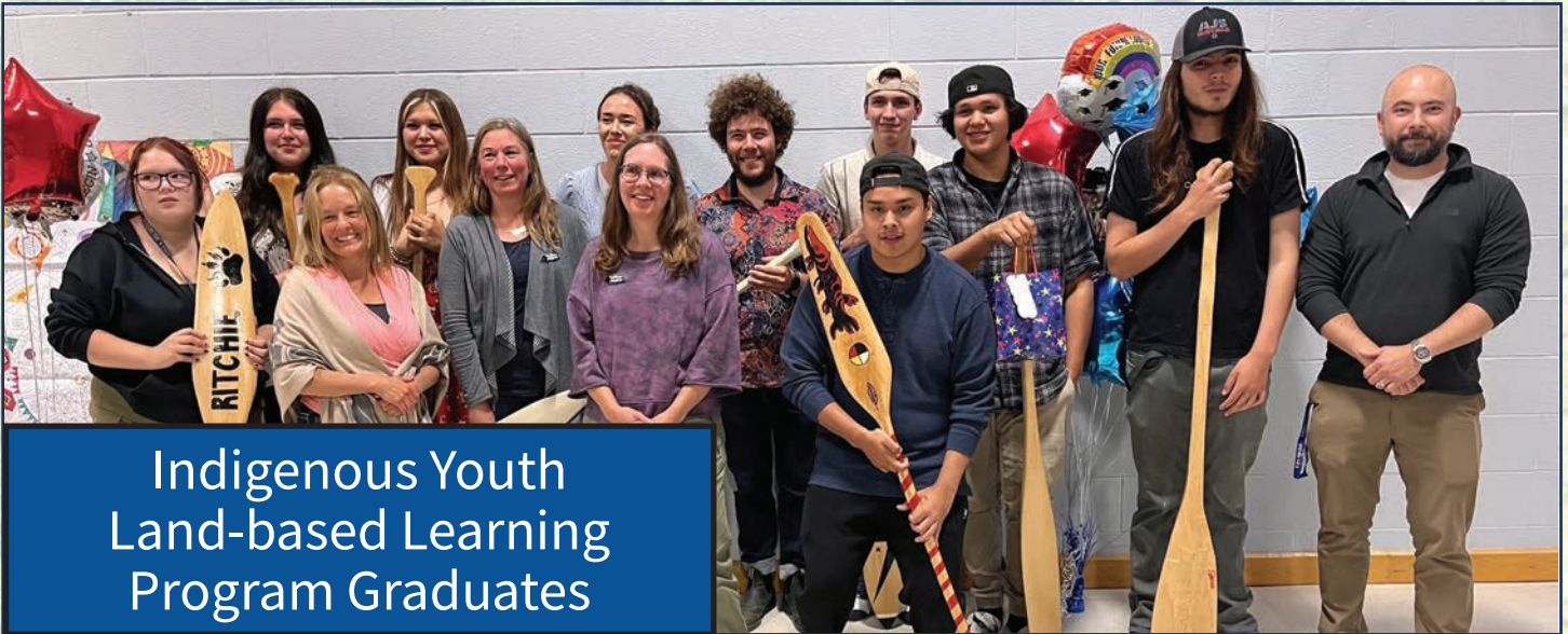
Indigenous Youth Land-based Learning Program Graduates